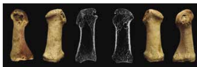
Lesions associated with hallux valgus on the metatarso-phalangeal bones of an adult female from the Augustinian friary.

“Modern clinical research on patients with hallux valgus has shown that the deformity makes it harder to balance, and increases the risk of falls in older people,” said Dittmar. “This would explain the higher number of healed broken bones we found in medieval skeletons with this condition”..