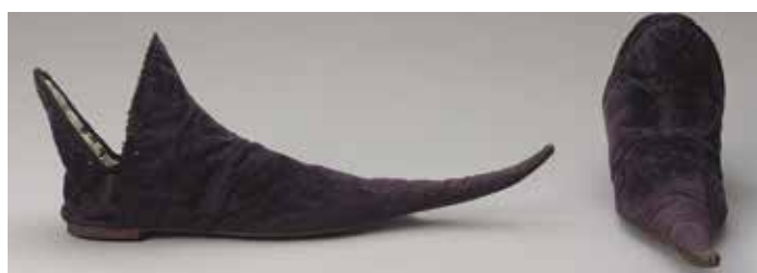
A pair of poulaine shoes from the 15th century, housed in the Museum of Fine Arts in Boston, US.

Across late medieval society the pointiness of shoes became so extreme that in 1463 King Edward IV passed a law limiting toe-point length to less than two inches within London.