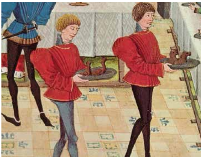
The fashion for extremely pointy ‘poulaines’ can be seen in this detail of a 15th century illuminated manuscript.

“We investigated the changes that occurred between the high and late medieval periods, and realized that the increase in hallux valgus over time must have been due to the introduction of these new footwear styles,” said Mitchell.