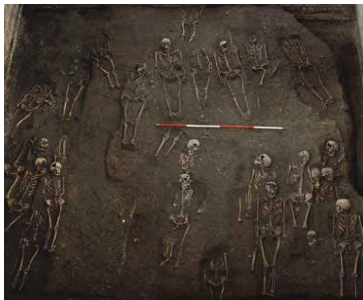
The remains of numerous individuals unearthed on the former site of the Hospital of St. John the Evangelist in Cambridge, taken during the 2010 excavation.

In a paper published in the International Journal of Paleopathology , the team from Cambridge University's After the Plague project argues that these "poulaine" shoes drove the rise of bunions in medieval Britain.